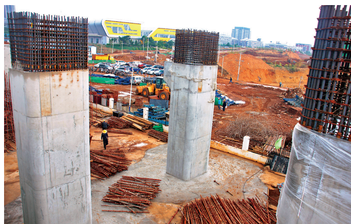
Workers are busy with the construction of high-speed rail