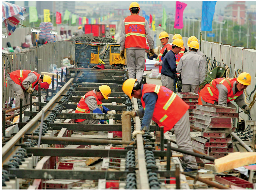
Workers are busy with the construction of Kunming subway