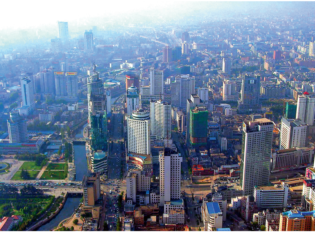
Bird-eye-view over Kunming city