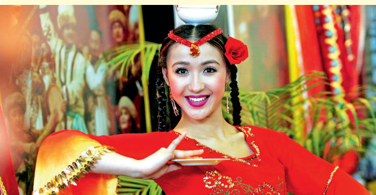
Acrobatic performance during the last session of the Expo