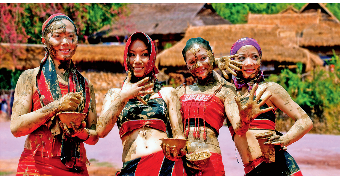
Tourists are posing for photos after smearing each other with black muddy cream during the Festival.