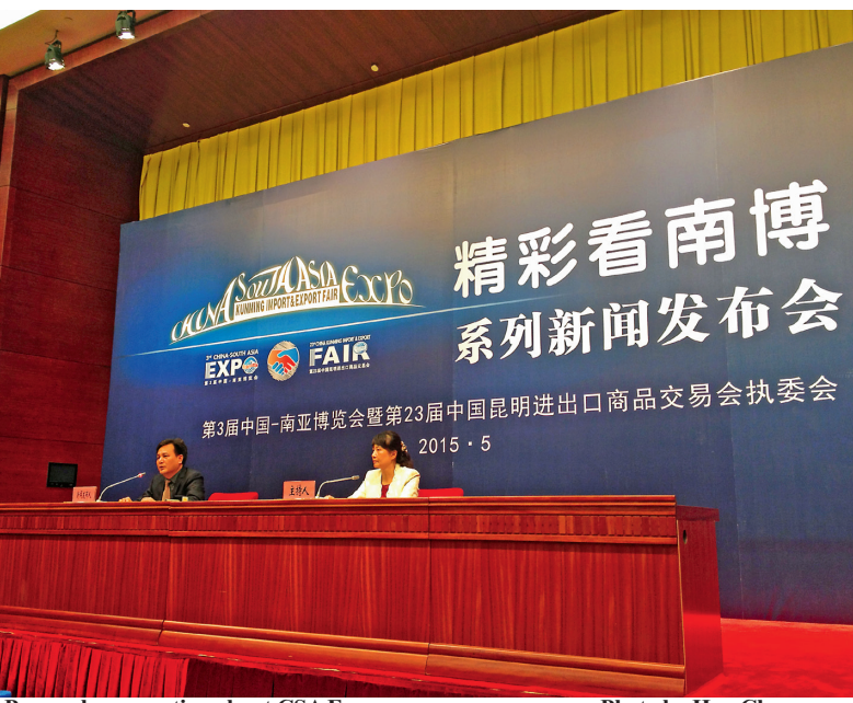
Press release meeting about CSA Expo