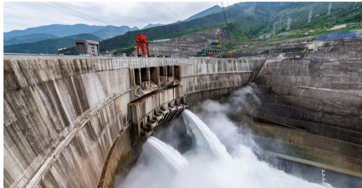
Baihetan hydropower station in Yunnan Province, China

The snow-capped peaks and the lush Gaoligong mountain that extend for hundreds of miles are species gene pools straddling the China-Myanmar border, while the Three-parallel Rivers in China's southwest Yunnan province is a treasure house for conserving national ecology and biological diversity.