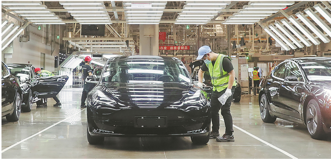
Employees at work at the Shanghai plant of Tesla Inc.

Despite rising external uncertainties, multinational companies remain committed to China as they plan to expand their local footprint and investment, and are impressed by the nation's latest commitment to high-standard opening-up and high-quality economic development, global business leaders said.