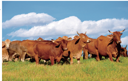
Hybrid cattle in Yunnan

In early 1990s, when Yunnan scientists were amazed by the previous generation of hybrid cattle, the problems also came up that many of them