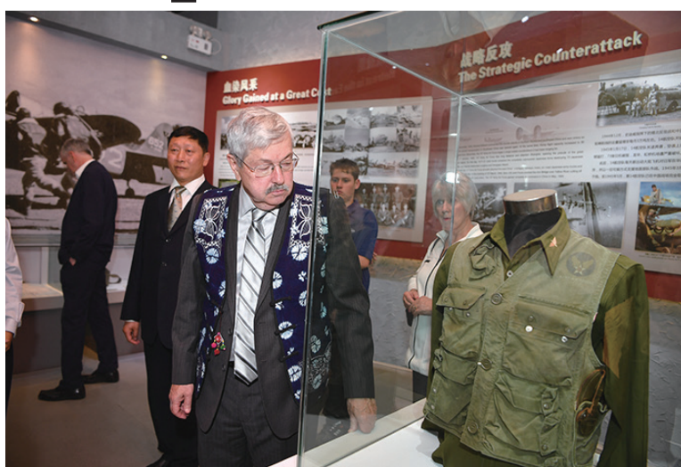
Terry Branstad visits Flying Tiger Exposition in Kunming Municipal Museum

"I hope more Americans would learn about the history of the Flying Tigers, how these American pilots helped the Chinese against invaders and the Chinese people helped the wounded pilots. Such great friendship was formed in those