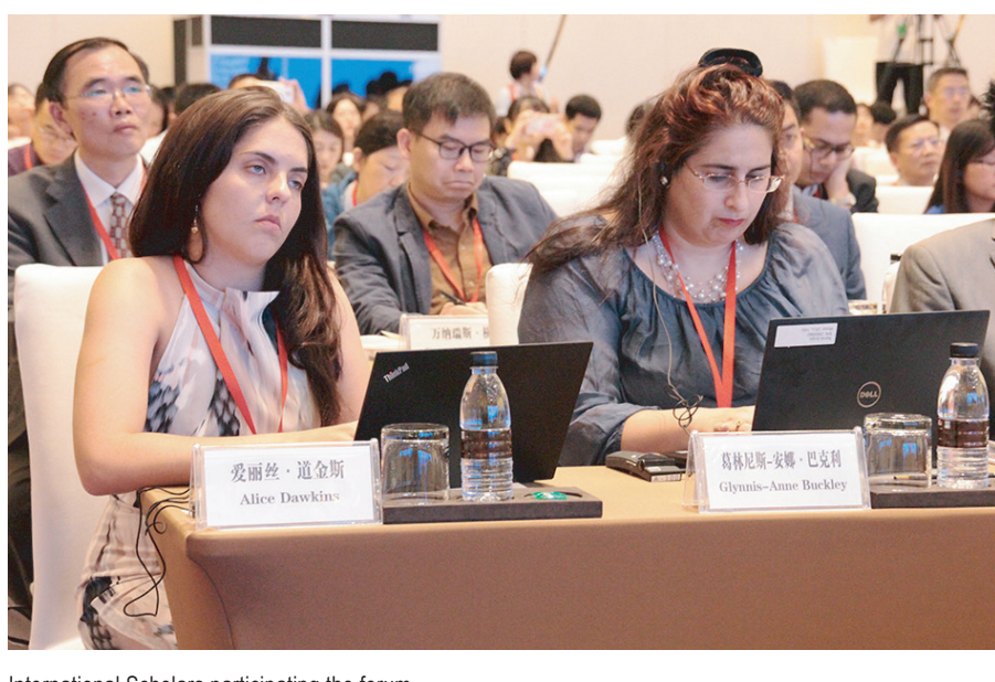
International Scholars participating the forum.

and Southeast Asia by relying on its foundation, resources and ability. In the future, Yunnan province would play a very important role in this aspect.