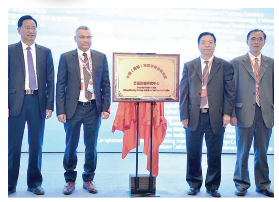
Inauguration ceremony of Centre for Pakistan Studies, Chinese (Kunming) Academy of South and Southeast Asian Studies was held during the 7th China - South and Southeast Asia Think Tank Forum.

The 7th China - South and Southeast Asia Think Tank Forum was opened in Kunming on June 12. Currently, this forum has highest-profile become the high-end think tank forum with the largest number of participants, the widest range of agenda setting and the most abundant accomplishment among China (Yunnan) and countries from South and Southeast Asia.