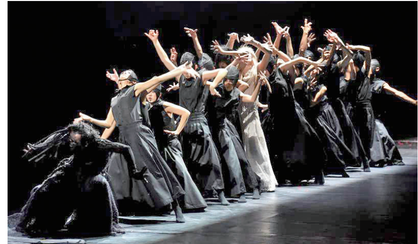
Dancers perform the dance opera Under Siege in Kunming, capital of southwest China's Yunnan province.