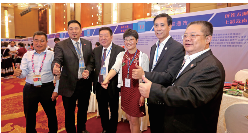
Guests of the 17th Asean Overseas Chinese Entrepreneurs Conference which opened in last June thumbs up for the business promotion session.

Under the framework of the Belt and Road, China and ASEAN countries have jointly carried out China-Singapore connectivity projects and key cooperation projects including China-Malaysia Qinzhou Industrial Park, Malaysia-China Guantun Industrial Park, China-Myanmar Oil and Gas Pipeline, Indonesia Jakarta-Bandung High-Speed Railway, and China-Laos Railway, China-Thailand Railway. The Protocol on Upgrading the China-ASEAN Free Trade Area came into effect after all domestic procedures of China and the 10 ASEAN countries were finally completed. By Qiu Haifeng